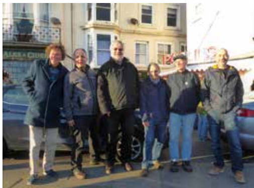
A likely looking bunch outside the Albion in Hastings

Scoring is based on the same principles as the PotY vote with a number of categories to ensure the breadth and depth of the pub and cider offer was tested. Quality of cider as well as knowledge and promotion of the