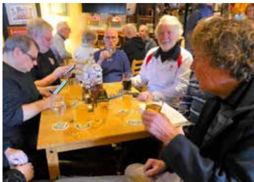
Sampling and scoring in Waterworks, Rye

An eclectic mix of ciders were enjoyed at all four locations. Ciders from Sussex and Kent, including from Ascension, Hunts of Sedlescombe, Nightingale and Wise Owl were enjoyably sampled, as well as ciders from further away, such as Celtic Marches (Worcester), Pulpt (Somerset) and Ross-on-Wye!