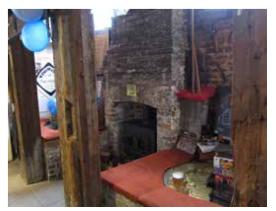
Interior of Rye Waterworks Micropub, showing brick surrounds for soup vats, now being used for seating!

Like most CAMRA members. I don't just go to the pub for a decent pint. I also love the conversation with friends and strangers. being able to relax in a hub of the community and, most of all, I enjoy discovering stories. This led me to wonder-if they could talk--what stories would pubs tell about themselves and their locality? I've attempted to answer that question in my book Unusual Pubs, Amazing Stories . The result is a pub guide with a difference. featuring 120 hostelries you can visit all over Britain, Covid-19 lockdowns permitting. There are stories from folklore and history. tales of notoriety and celebrity—such as John Lennon's student local and a pub once owned by the Kray twins—and lots more.