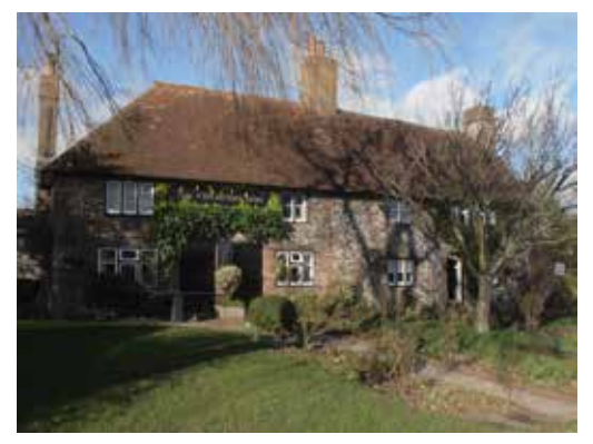
The Cricketers' Arms

The Cricketers' Arms reopened in September with new management after a refurbishment. Food remains an important part of their offering. Harvey's ales are served as before, by handpump or direct from casks in the taproom. The Cricketers' is open every day, further information can be found on their website - www.cricketersberwick.co.uk.