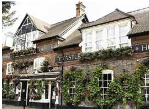
The Quaint Castle Inn Hotel, Bramber, is on the Beer Walk and in CAMRA's Good Beer Guide.