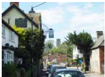
Castle Hotel and Bramber village, just one of eight pubs on the 27th May Beer Walk

Revellers – including me – flock there but of course the winter weather can be challenging.